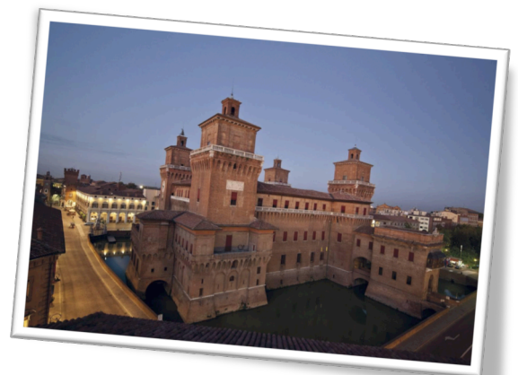
Ferrara, The castle

For further information and application form see our website: